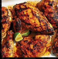
JAMAICAN JERK CHICKEN