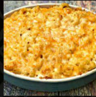
SOUTHERN STYLE MAC & CHEESE