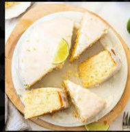
COCONUT CAKE WITH LIME GLAZE