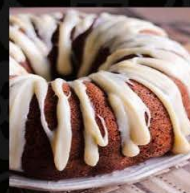
SWEET POTATO BUNDT CAKE