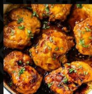
HONEY & TURMERIC CHICKEN