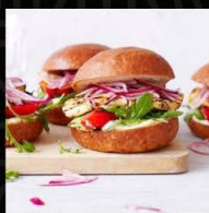
JERK HALLOUMI BURGER