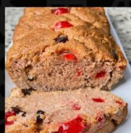
BAJAN SWEET BREAD